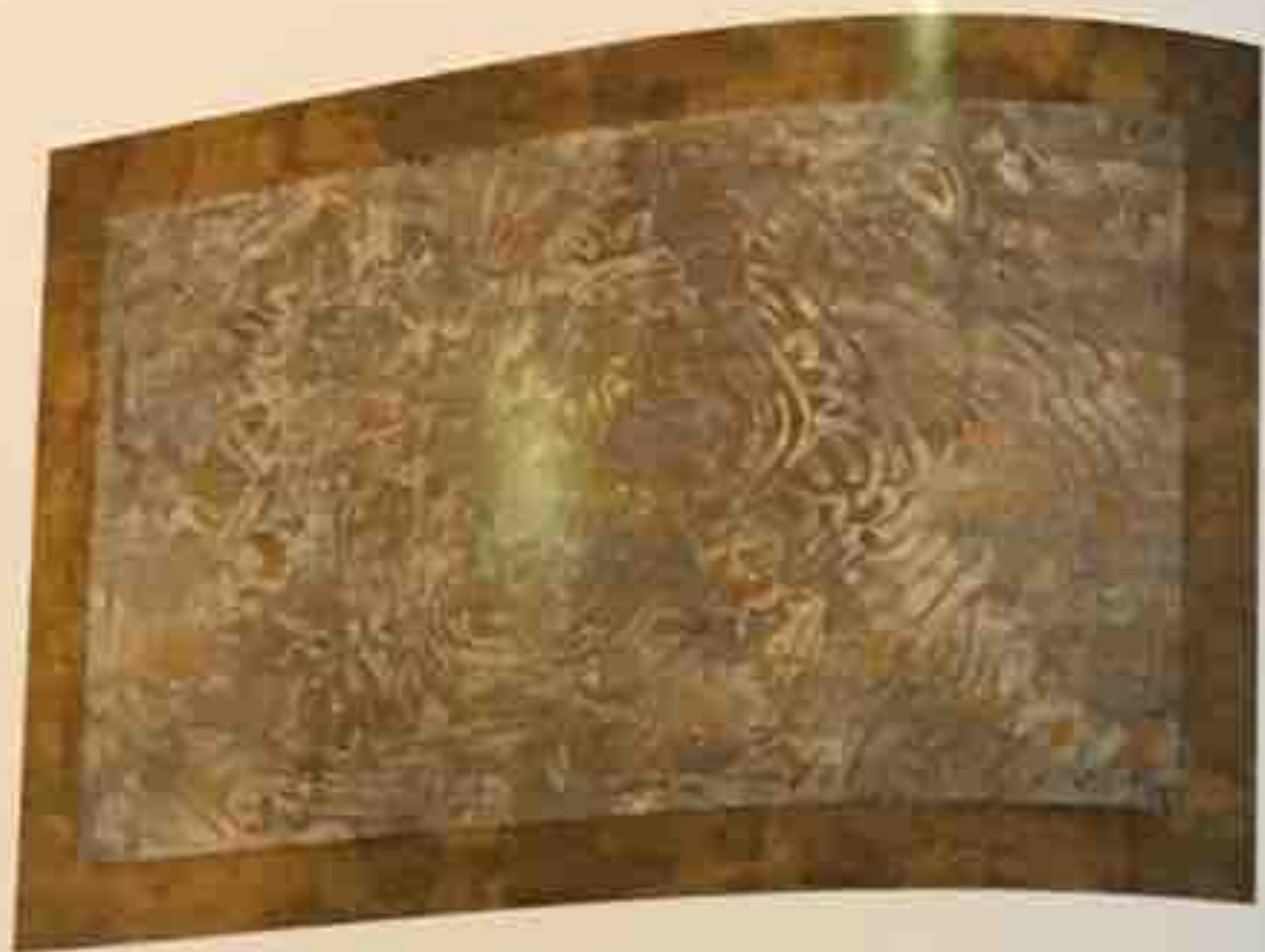
Sepas / Mixed media on canvas / 187 x 273 cm / 2011