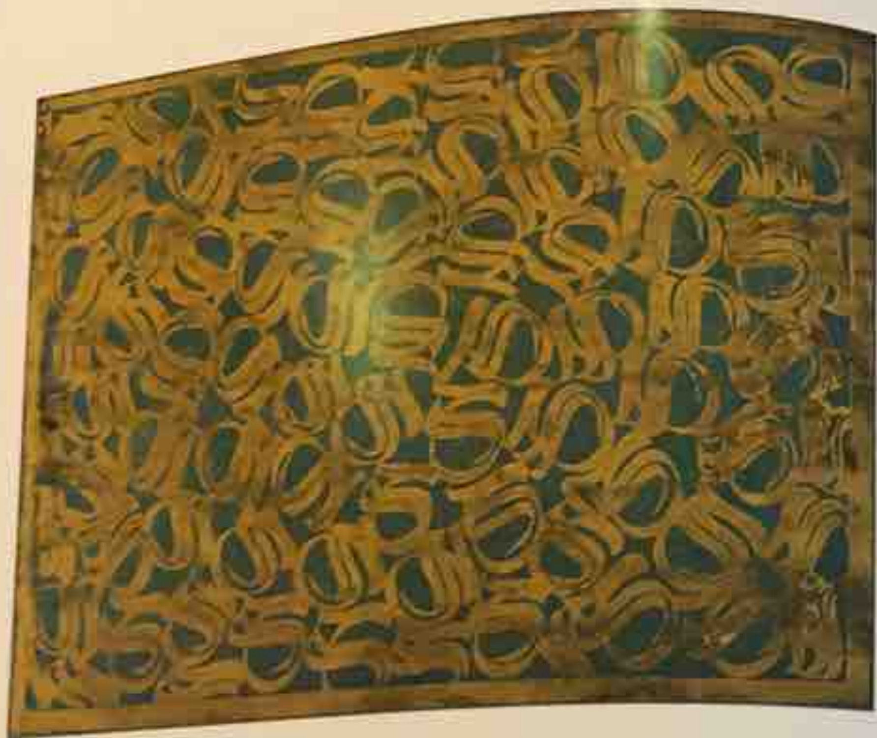
Hamide Hazer / Mixed media on canvas / 147 x 173 cm / 2011