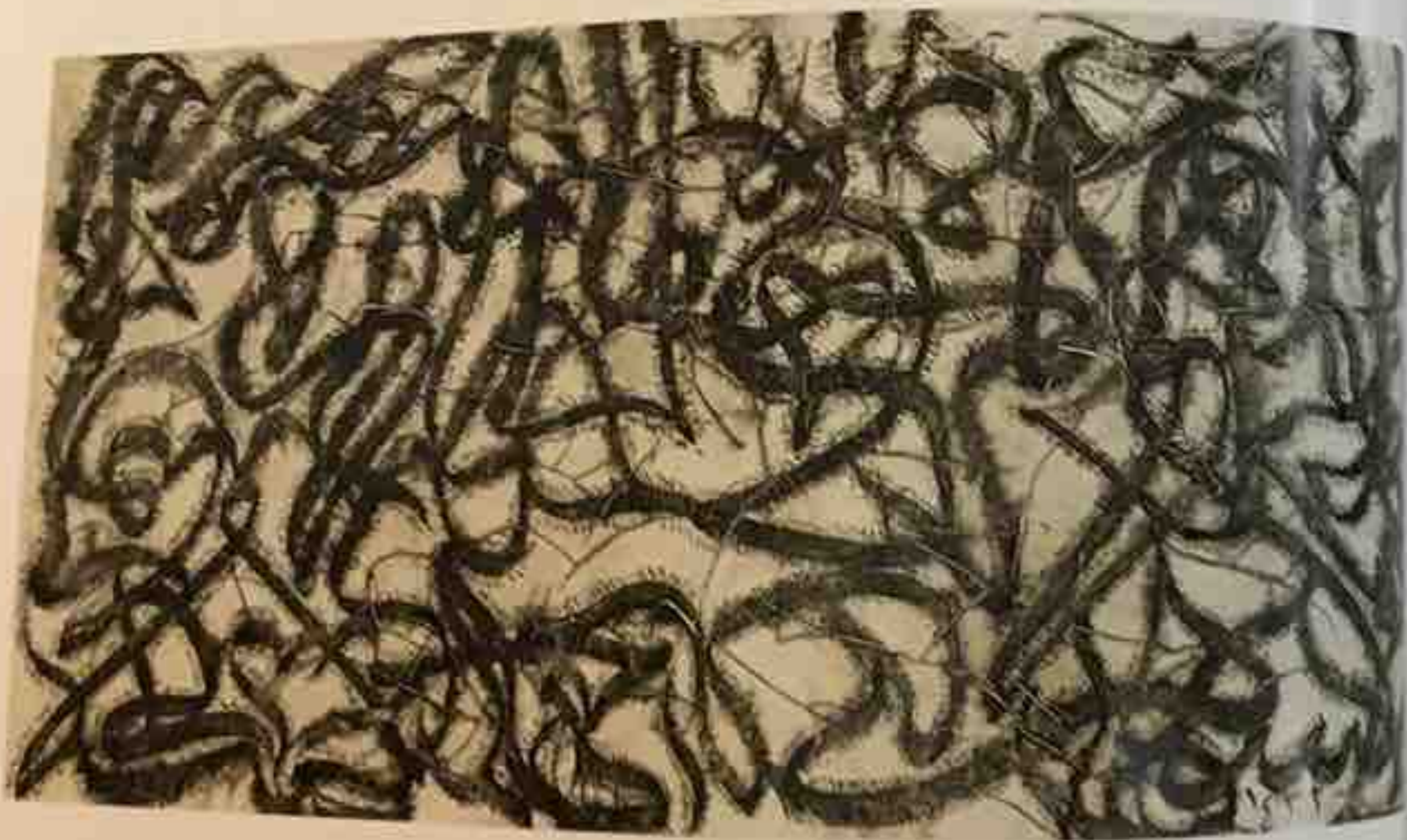
Telesma Hasti / Mixed media on canvas / 155 x 320 cm / 2011