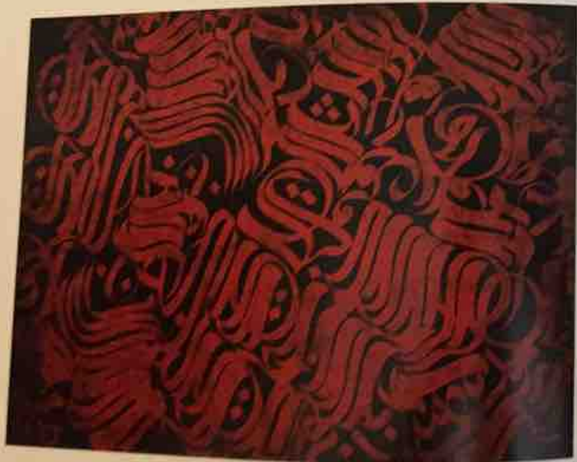
Faris Saleh / Acrylic on canvas / 116 x 158 cm / 2011