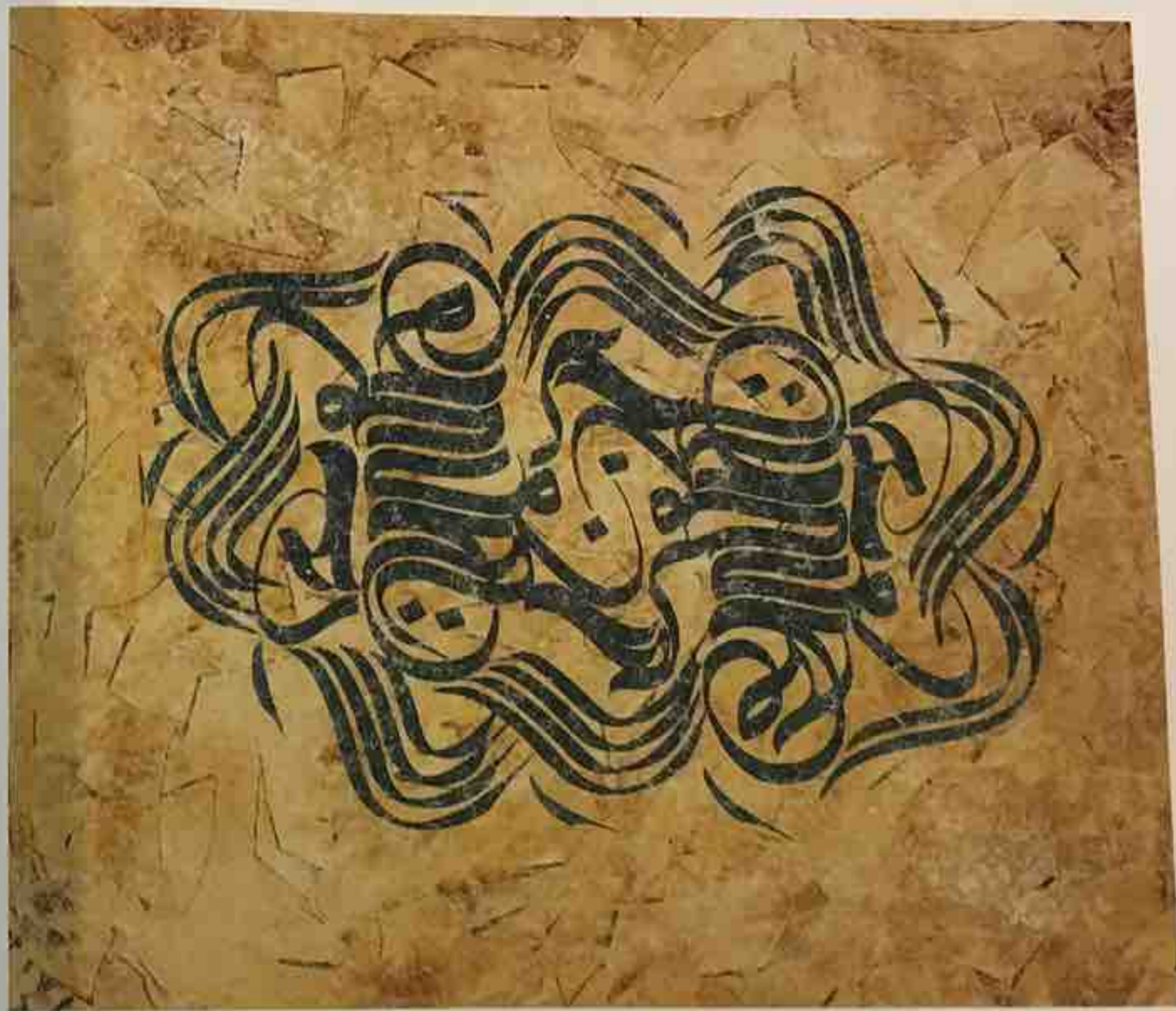
Haghghat Vajgon / Mixed media on canvas / 188 x 221 cm / 2011