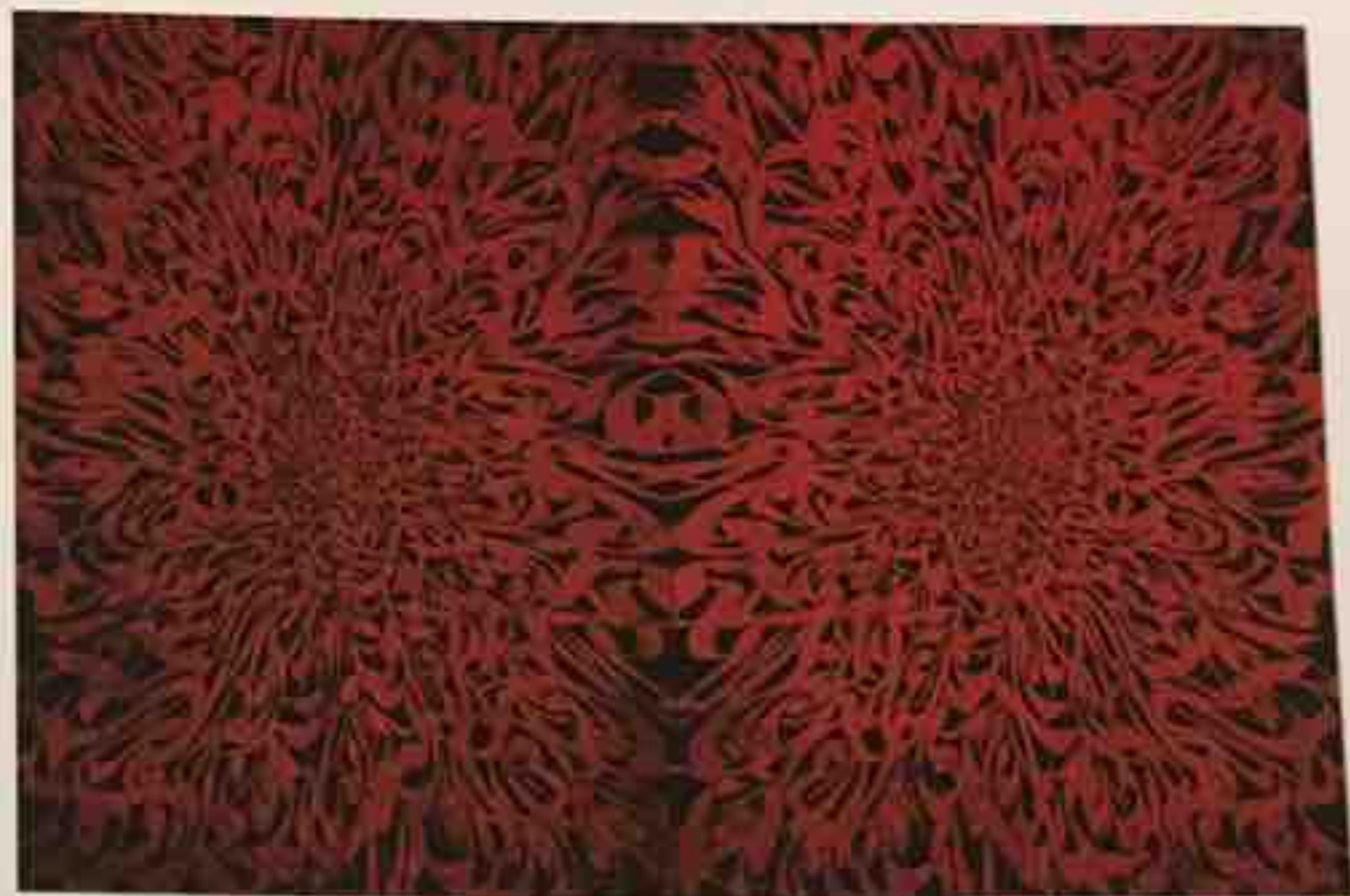
Ho / Acrylic on canvas / 159 x 231 cm / 2012