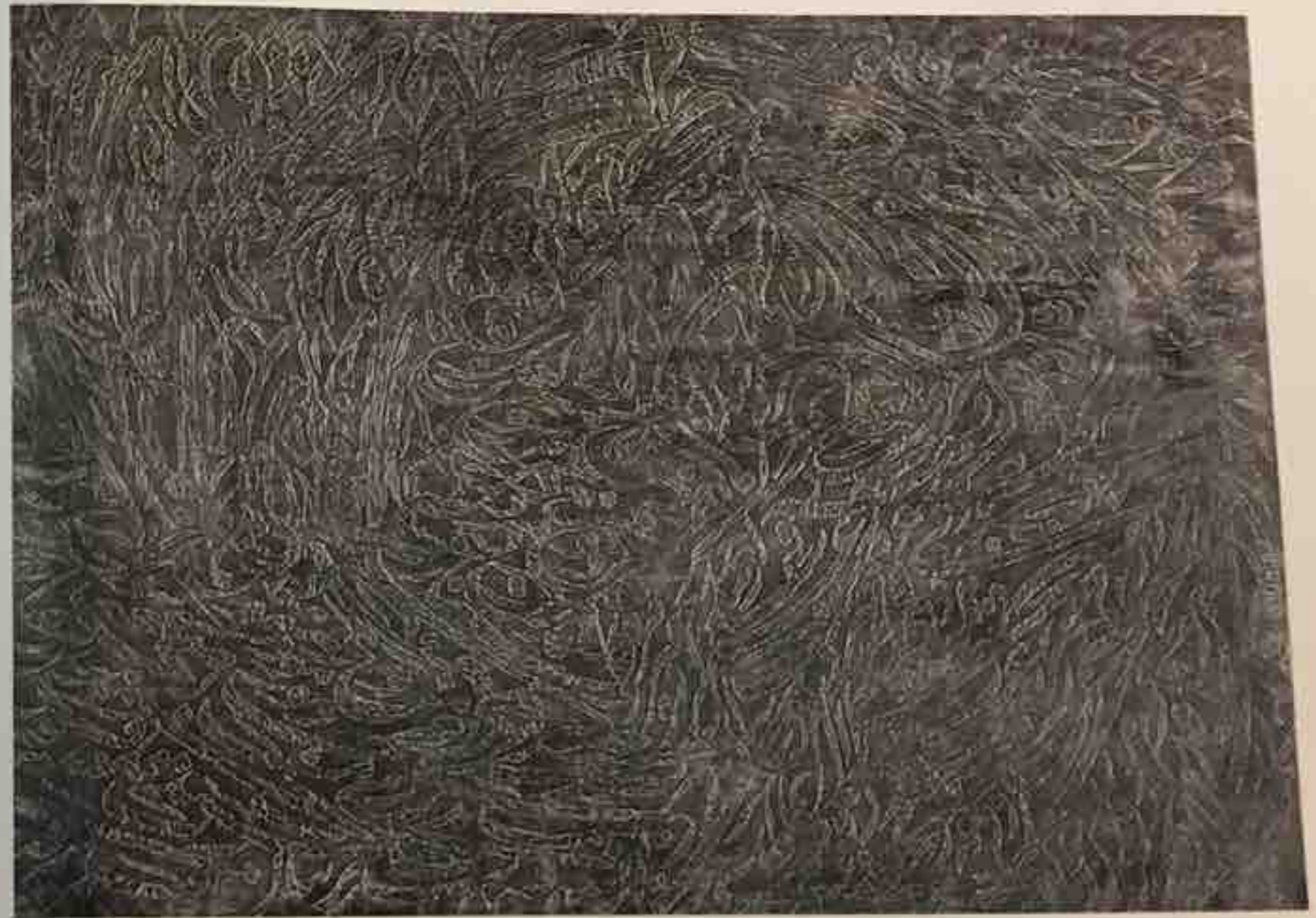
Hobool / Mixed media on canvas / 112 x 164 cm / 2011