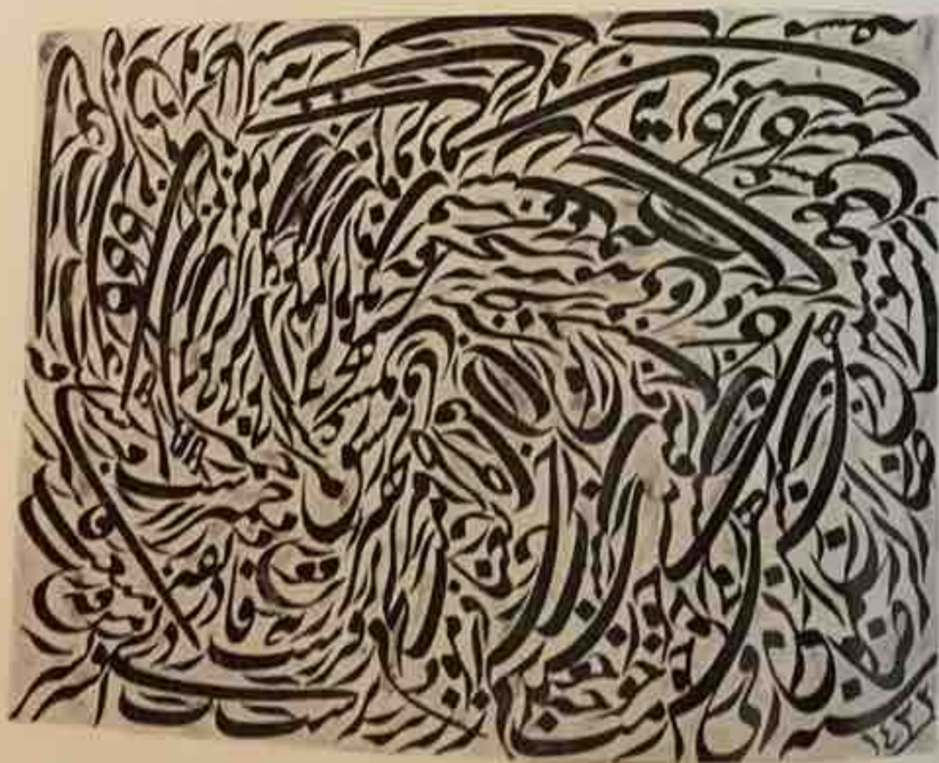
Baraye Zendege / Acrylic on canvas / 118 x 175 cm / 2011