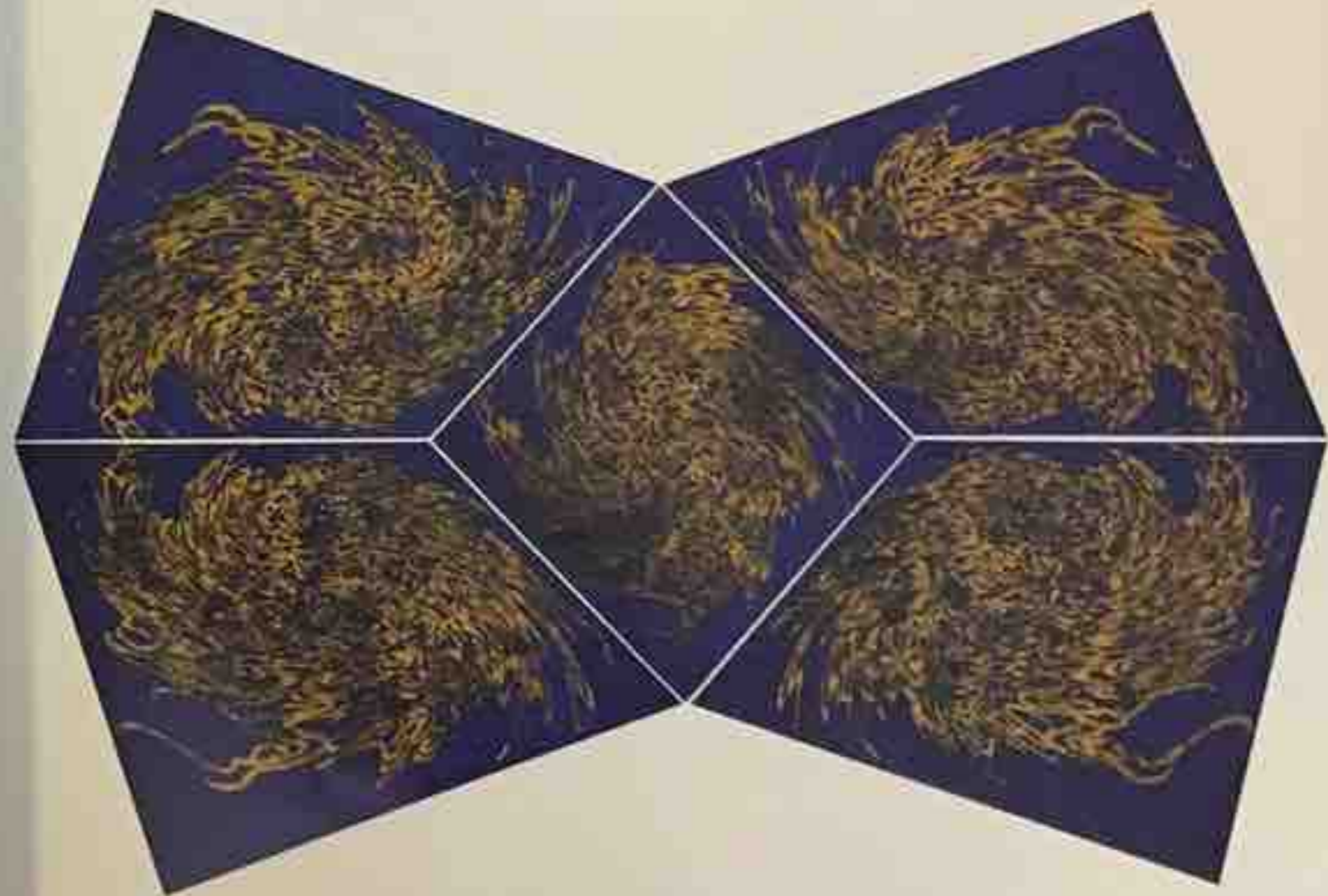
Satisfaction / Mixed media on canvas / 240 x 330 cm / 2012