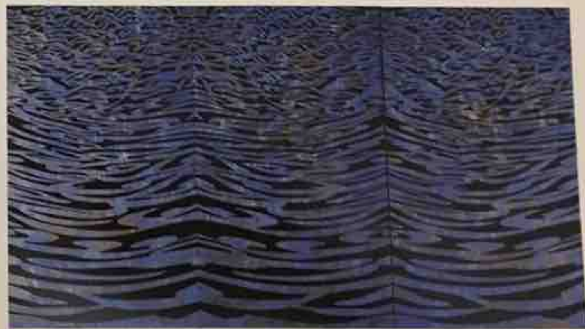
Sea / Mixed media on canvas / 176 x 312 cm / 2012