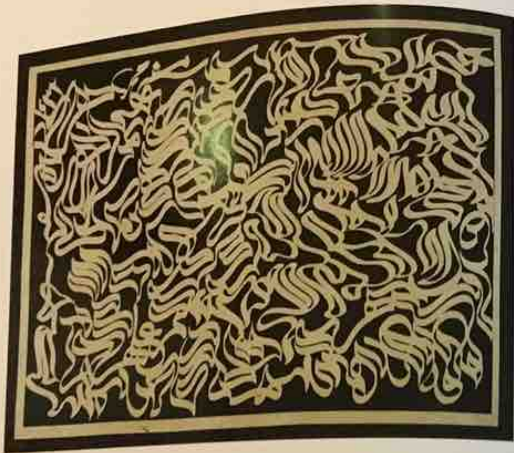
Sepas / Acrylic on canvas / 140 x 178 cm / 2011